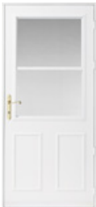
Rolscreen® Storm Door Model 3550