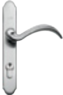
MODEL 5625E AND 5600E

Choose decorative finishes to coordinate with other finishes in your home.